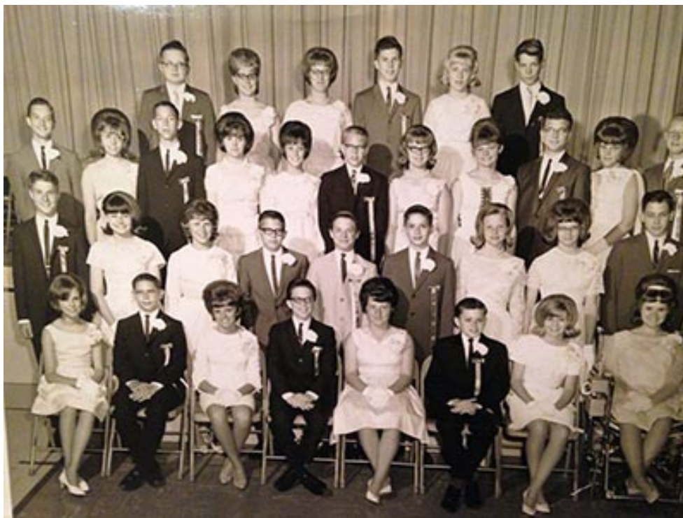
Sunnybrook Graduating Class of 1965