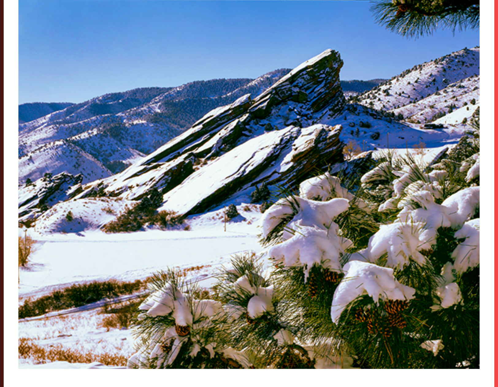
Red Rocks Amphitheatre, Denver, Colorado (elev. 6,400 feet) —photo by Mike Wright (Colorado).